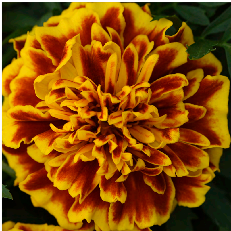
A frilly French Marigold for a flash of color

Look for Alyssum and Lobelia in our Annuals for Cool Weather care sheet. Information about zonal-and ivy-style Geraniums can be found in our Geranium and Spring Sunbasket care sheets