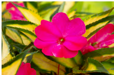
Variegated foliage of SunPatiens Compact Tropical Rose