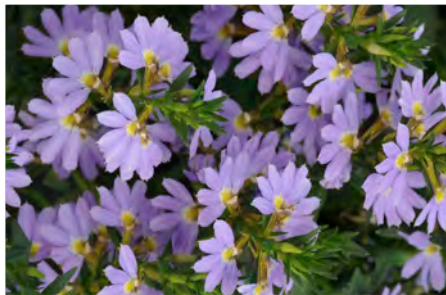
Unique fan-shaped flowers of Scaevola